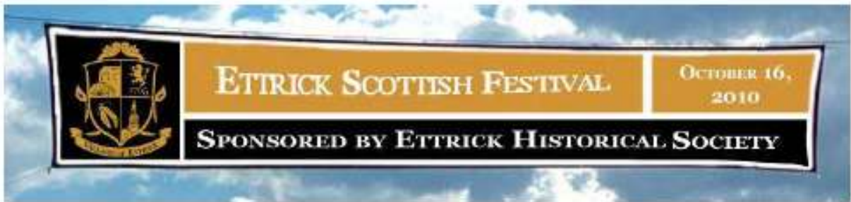
CONCEPTUAL OVERHEAD BANNER