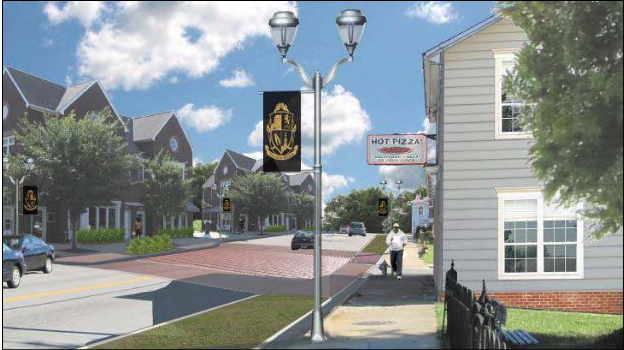
Conceptual - After