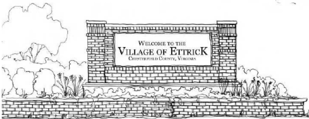
MONUMENT WELCOME SIGN

The Chesterfield Avenue Enhancement Project – Final Conceptual Design was finalized in March 2010. The final design document may be viewed at www.chesterfield.gov under revitalization. These final concepts are being transformed into construction documents for project implementation. Phase 1 construction is scheduled to begin in August 2010. The first design elements that will be introduced in phase 1 will be banners, welcome signage, village seals imprinted at select intersections, crosswalks, and landscaping.