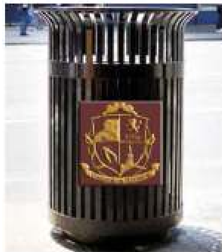
VILLAGE TRASH RECEPTACLE