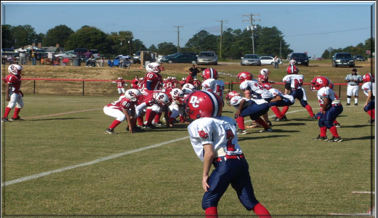
Above: Opening Day for Dinwiddie County Parks & Recreation's Youth Football program at the Dinwiddie Sports Complex.