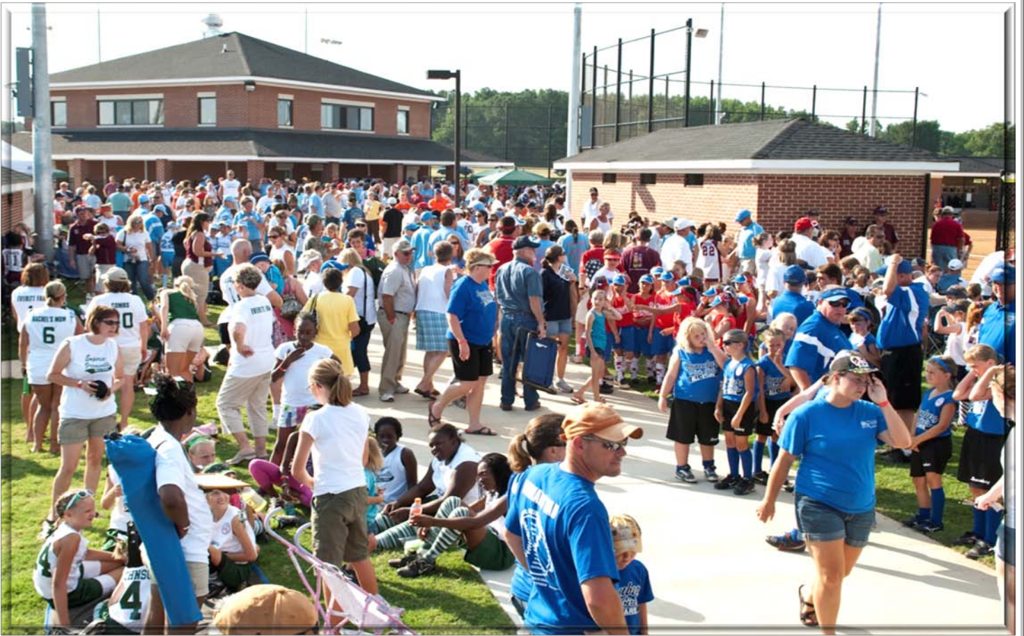
Above: Opening Day Tournament June 2011. Dinwiddie County Parks & Recreation and the Sports Complex hosts the Dixie Girls' Softball District Tournament.