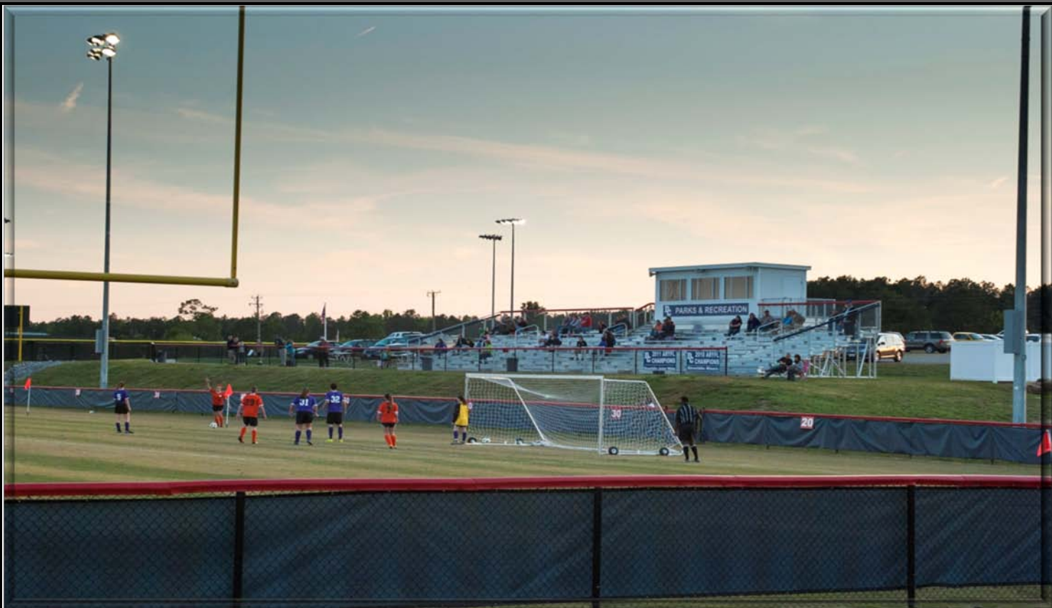
Above: Opening Day for Dinwiddie County Parks & Recreation’s Youth Soccer program at the Dinwiddie Sports Complex.