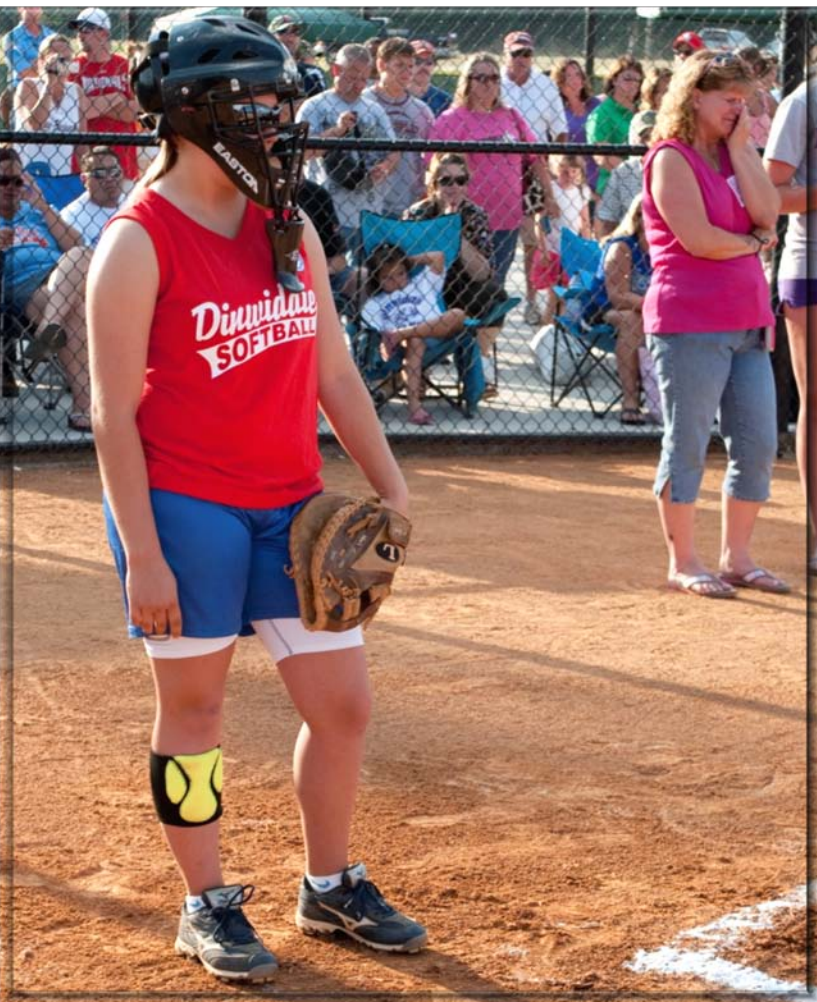
Left: Opening Day Image for the Dixie Girls' Softball Tournament June 2011.