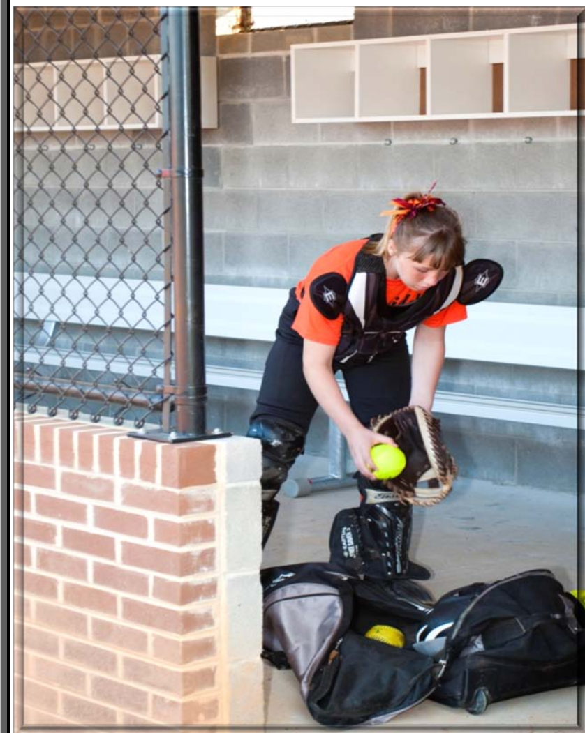
Left: Opening Day Image for the Dixie Girls' Softball Tournament June 2011.