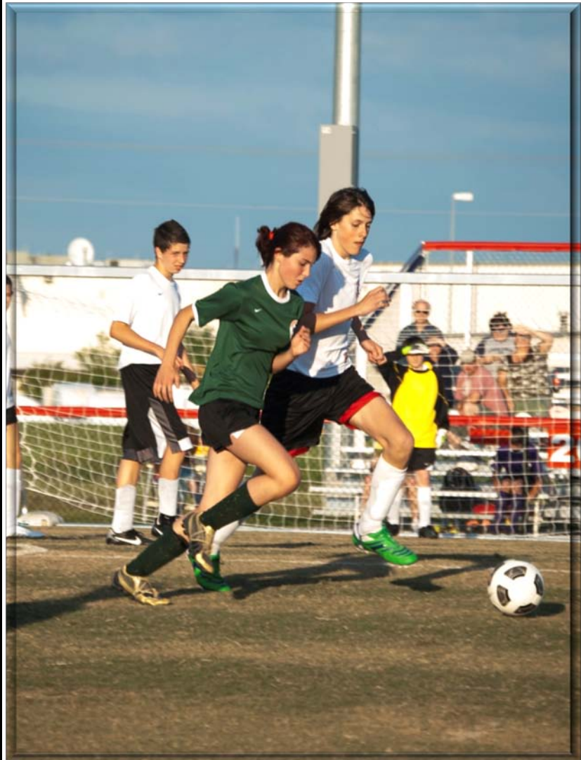
Left: Opening Day for Dinwiddie County Parks & Recreation’s Youth Soccer program at the Dinwiddie Sports Complex.