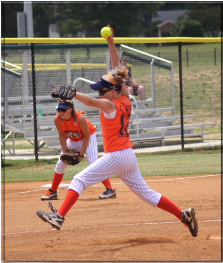
Left: Opening Day Image for the Dixie Girls' Softball Tournament June 2011.