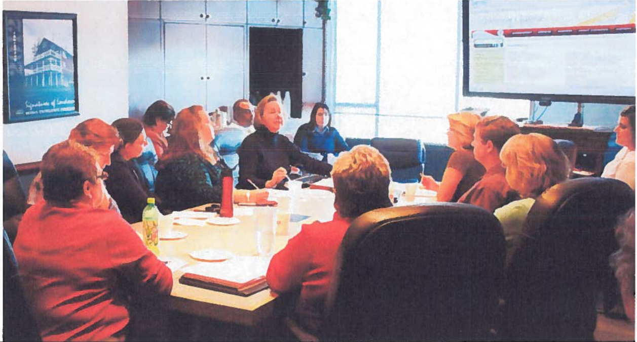
Members of the Loudoun County Business Assistance Team hold regular meetings as part of the team's continued effort to provide a streamlined and coordinated response to small business customers.