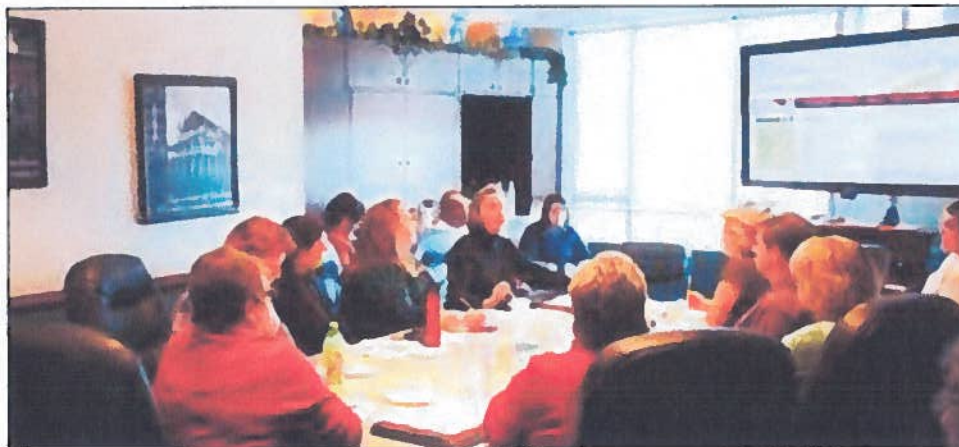
Members of the Loudoun County Business Assistance Team meet regularly to discuss efforts to improve the commercial development process.

More information about the Business Assistance Team, including easy-to-follow links to important information for business customers, is online at www.loudoun.gov/businessassistance .