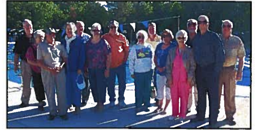
Members of the Curtis Family attend the ribbon cutting at Curtis Park pool.