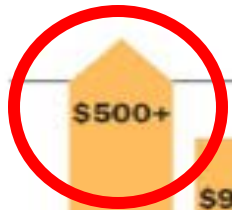
Relative Per-Pound Costs of Reducing Nitrogen Pollution in the Chesapeake Bay Region