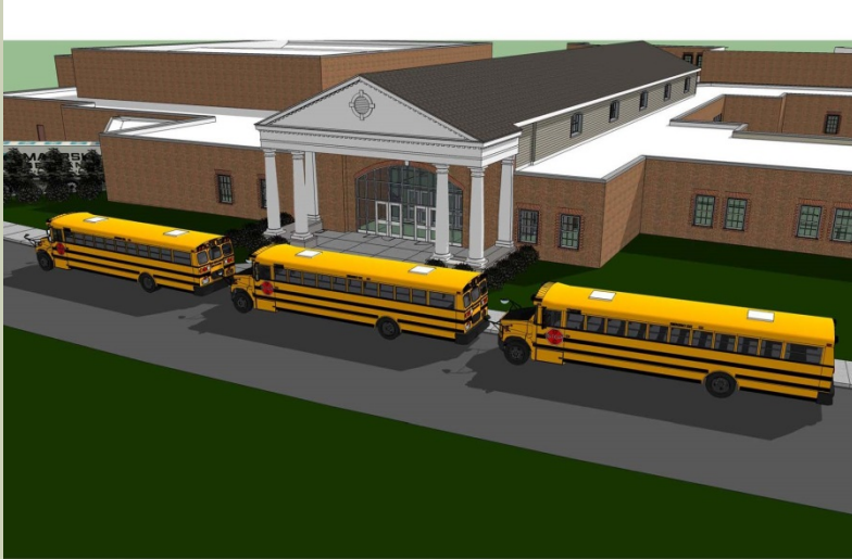
BUS DROP OFF @ STUDENT COMMONS