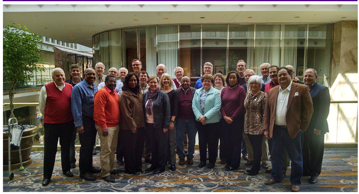
Graduates of VACo's 2016 Chairpersons' Institute