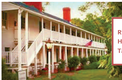
Rice’s Hotel/ Hughlett’s Tavern

In Heathsville is Rice’s Hotel/Hughlett’s Tavern, a café and heritage arts and artisan center with textiles, basketry, jewelry and more. The Tavern has working heritage guilds which give classes on blacksmithing, carpentry, spinning, weaving, and other heritage crafts. The Northern Neck Farm Museum, between Heathsville and Burgess, has Farm-to-Table dinners, sawmilling workshops, and farming events that celebrate the history of agriculture and forestry in the five-county Northern Neck.