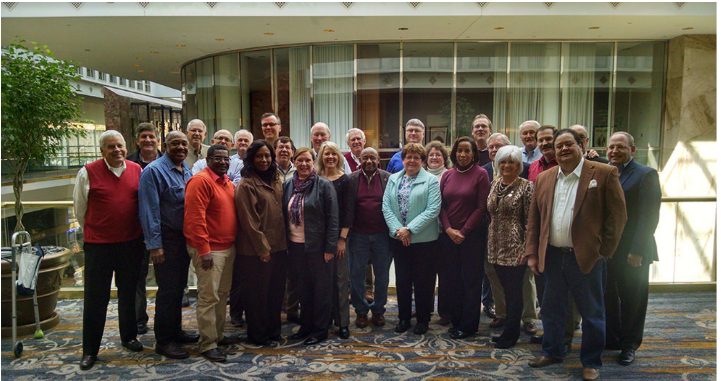
Graduates of VACo’s 2016 Chairpersons’ Institute