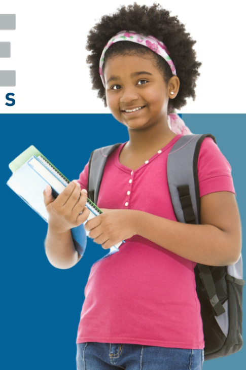
PHOTO SPEED ENFORCEMENT