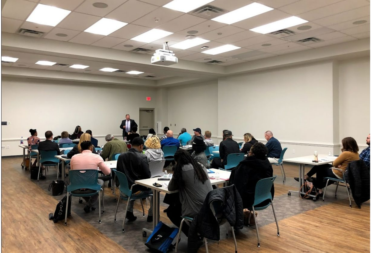
Chesterfield County Reentry Resource Fair