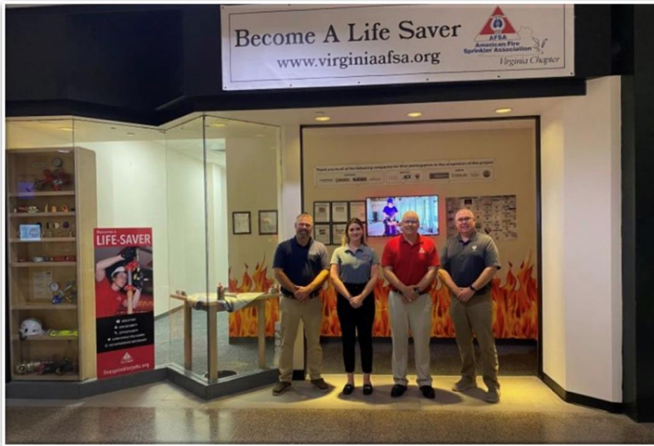
The Virginia Chapter AFSA Adult Education at Regency Store Front