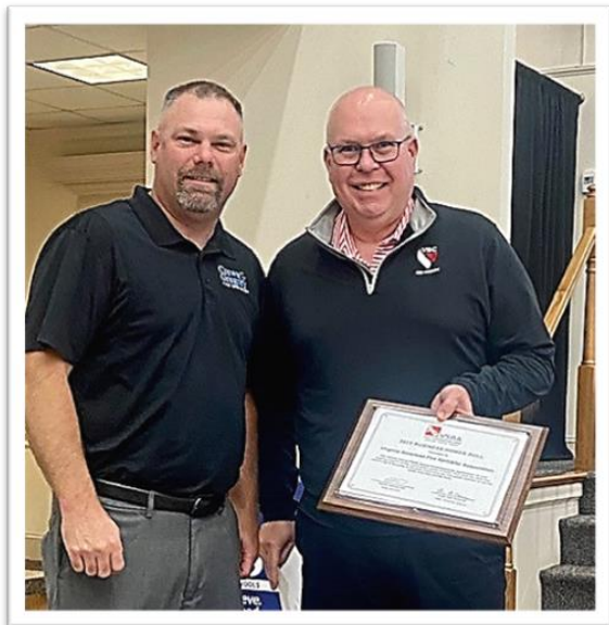
The School Board of Henrico County named The Virginia Chapter of the American Fire Sprinkler Association , to the 2023 Virginia School Boards Association Business Honor Roll, showing appreciation for their ongoing support in preparing students to be Life Ready. Additional Media: