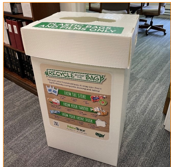
Figure 2: Bins were conveniently located at several Orange County facilities.