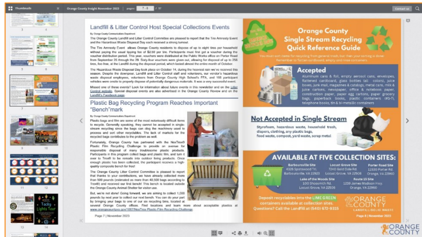
Figure 5: The Orange County Insight newsletter is a well-read publication of our organization. The November 2023 issue highlighted the plastic film recycling program collecting enough plastic to receive a composite bench from Trex!

The Communications Department helped leverage this success by creating a press release concurrent with America Recycles Day, as well as an article in our popular newsletter. Local news agencies picked up the story, and the resulting increase in awareness has helped the program accelerate like a snowball rolling downhill.