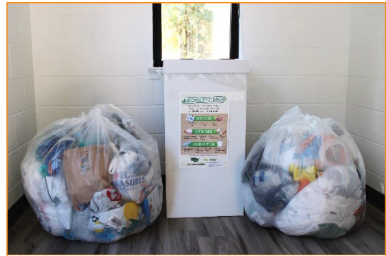
Figure 3: Each bin was filled with an affordable drum liner that was also recyclable within the program.

locations were chosen due to their ability to provide coverage across Orange County and the significant amount of foot traffic they regularly received. Locations included the main Orange County administrative building, each of our library buildings, the Landfill's office