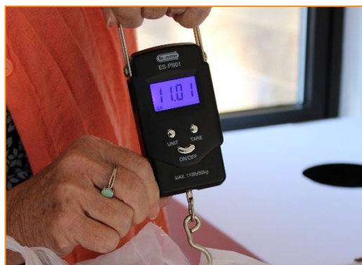
Figure 4: Most liners weighed about 11 pounds when full.

Thanks to the great turnout at government buildings and effective partnerships with local organizations, the response far exceeded staff expectations! The Litter Control Committee Coordinator visited each location regularly (or when called by the location), gathered the collected plastic, and prepared the bin to accept more. Orange County joined the program in the middle of