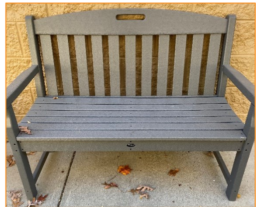
Figure 1: The first composite bench received by Orange County welcomes Animal Shelter visitors!

Finding a practical solution was the first hurdle; the next was implementing it in Orange County in a way that maintained convenience for our residents. With that in mind, Orange County Litter Control worked with the Public Works Department to locate several plastic film drop-off bins in county offices. Six