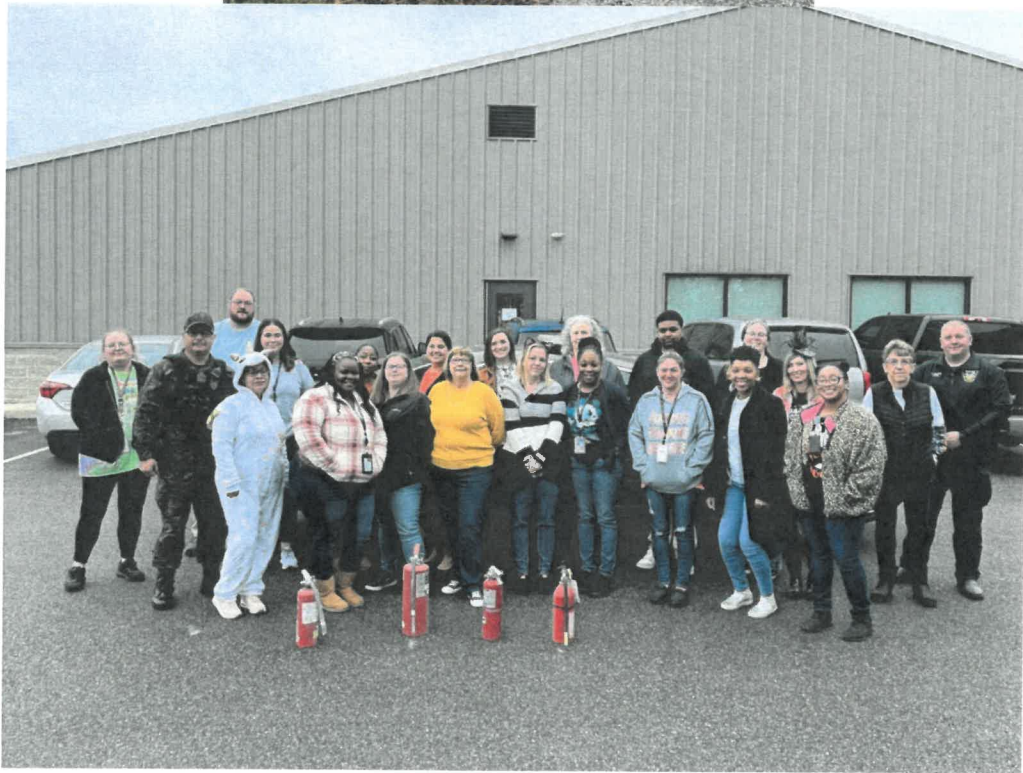
Caption: The S.M.I.L.E. Committee set up safety training for all agency employees with the Farmville Volunteer Fire Department to learn how to use fire extinguishers.