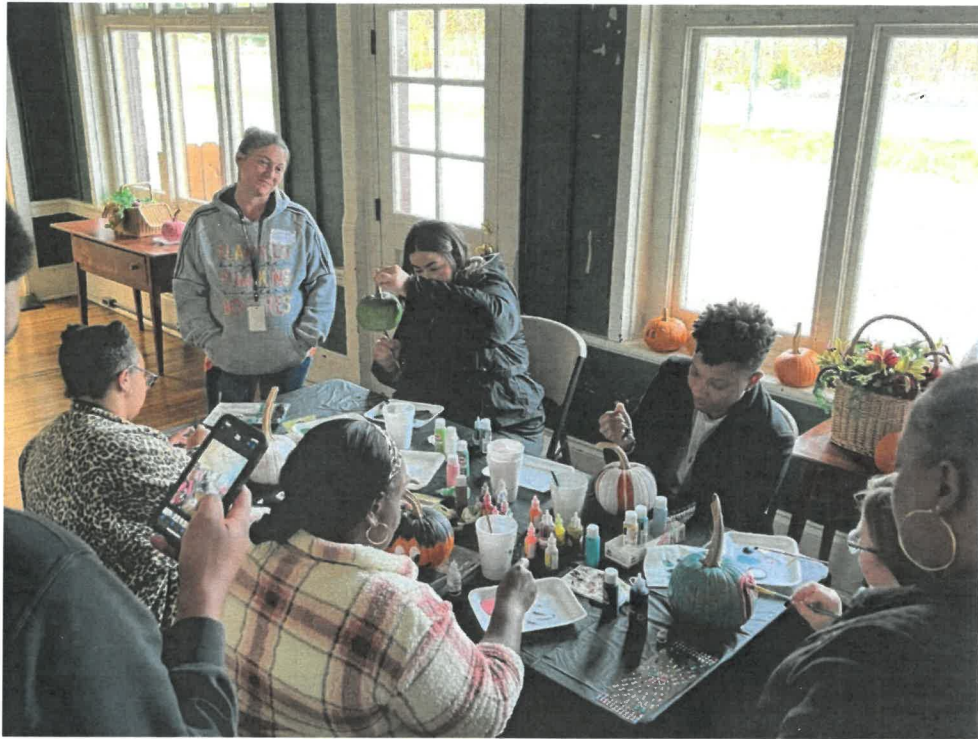
Caption: S.M.I.L.E. Committee members planned and hosted a Fall Festival Employee Appreciation Luncheon that included pumpkin decorating, trivia games, a corn-hole tournament, with door prize raffles and a luncheon donated by local businesses and restaurants.