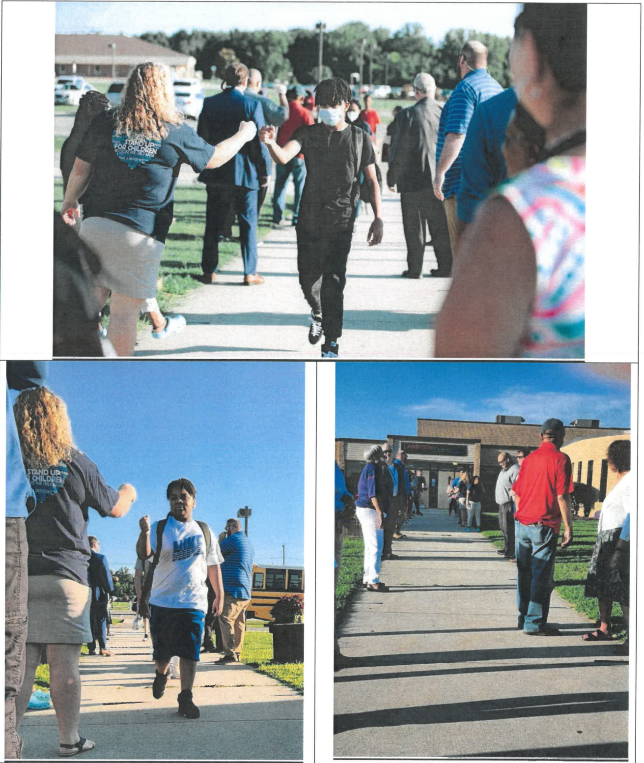
Caption: S.M.I.L.L.E. Committee members partnered with local officials and the community to “meet and greet and high-five” Prince Edward County Middle School Students on the first day of school.