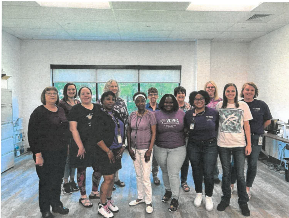
Caption: The S.M.I.L.E. Committee organized an “elder-abuse prevention wear purple day”. The half-day program included speakers from Piedmont Senior Resources Area Agency on Aging and the Centra Pace program.