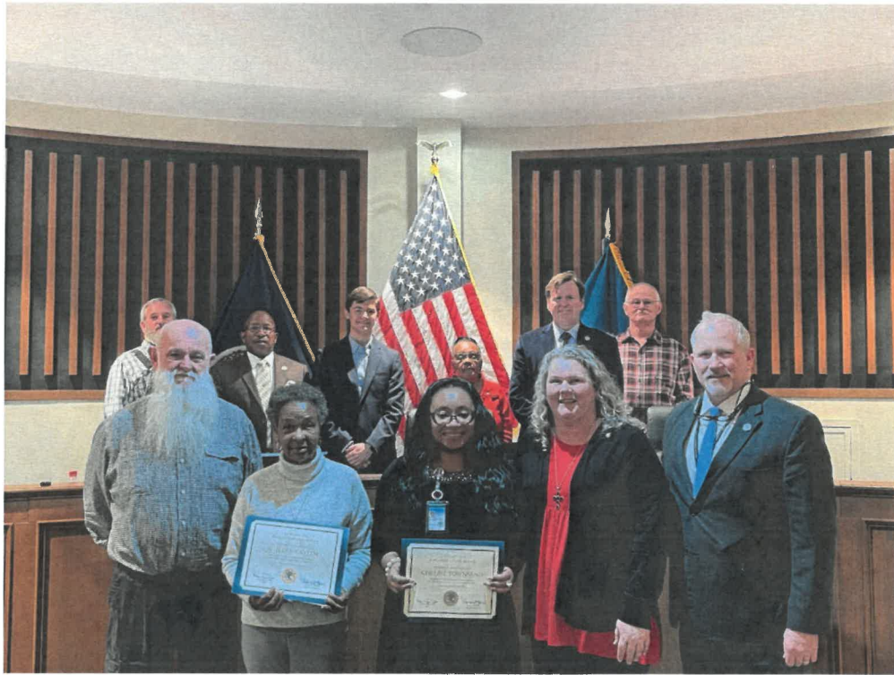
Caption: At its January 9, 2024 meeting, the S.M.I.L.E. Committee was recognized by the Board of Supervisors as “Employees of the Month”.