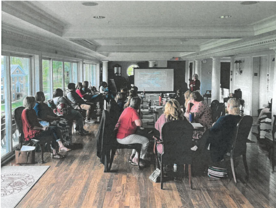
Caption: The S.M.I.L.E. Committee hosted a training for the agency at Hampden-Sydney College to discuss employee engagement and to explore the culture of the agency.